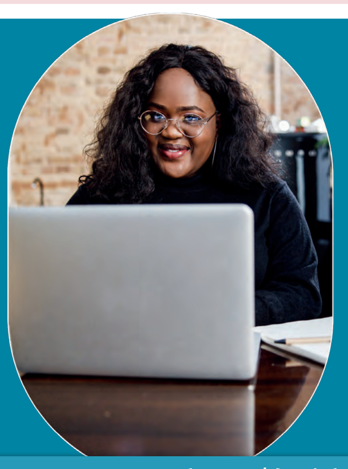
Go to: www.agh.care/dmrisk