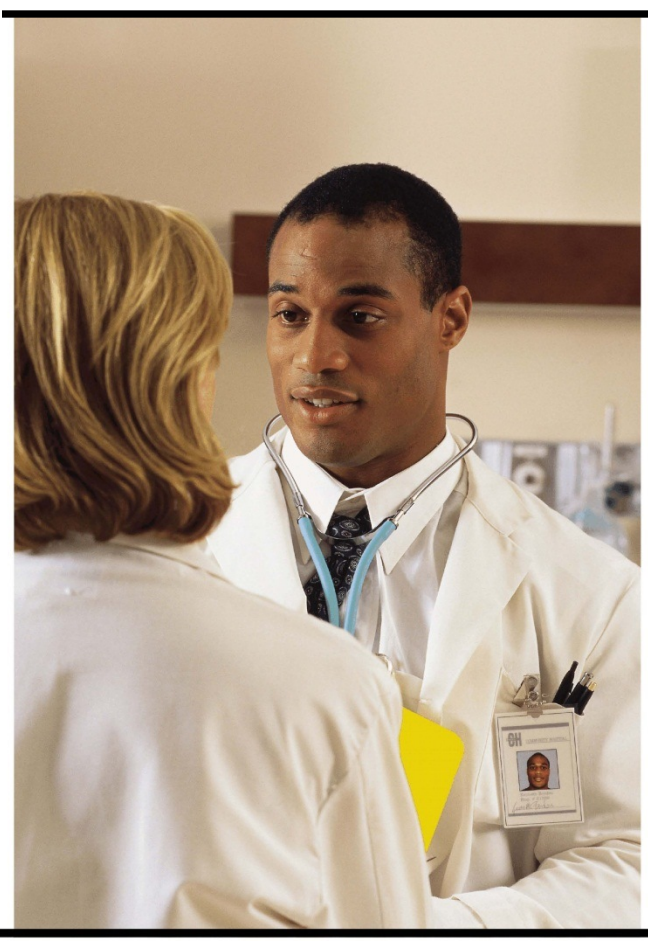
A Guide to Maryland Law on Health Care Decisions (Forms Included)

STATE OF MARYLAND OFFICE OF THE ATTORNEY GENERAL